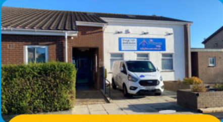
Grange Park Youth Centre 170 Horsebridge Road, FY3 7EA