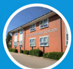
Layton Primary School Meyler Ave, FY3 7DX