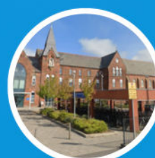
St Mary's Catholic Academy St Walburgas Rd, FY3 7EQ