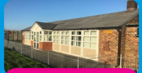
Whiteholme Youth Centre All Saints Rd, FY5 3AL