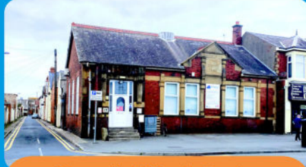
Bloomfield Youth Centre 205 Lytham Road, FY1 6ET