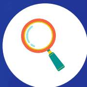
Checked & Safe Staff