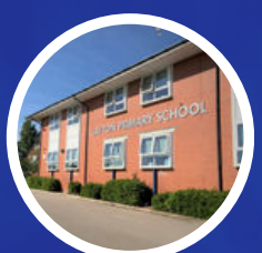
Layton Primary School Meyler Ave, FY3 7DX