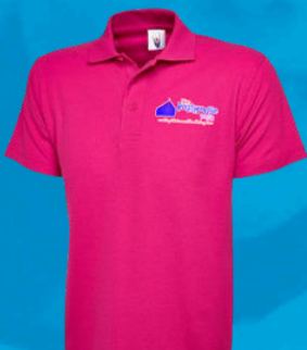
Youth Leaders Pink Polo Shirt / Hoodie

You can't miss our amazing team of staff, they'll be looking smart in our bright BHY Uniforms! They'll also have a handy name tag and ID badge nearby in case you forget who they are.