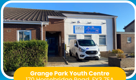
Grange Park Youth Centre 170 Horsebridge Road, FY3 7EA