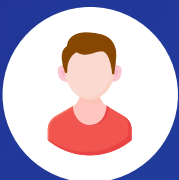
Uniformed + ID'd Staff

Our NUMBER ONE priority is that your child is always safe from harm when they are in the care of The BHY. Whilst we pride ourselves on the element of risk we introduce to children's play we also pride ourselves on our commitment to ensuring it is controlled and well-managed. Safeguarding encompasses many different elements and we have listed some of the aspects below.