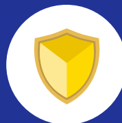
Staff Child Protection Training