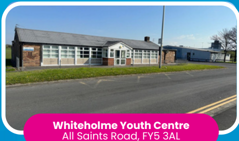
Whiteholme Youth Centre All Saints Road, FY5 3AL