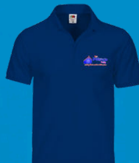
Operations Team Blue Polo Shirt / Hoodie