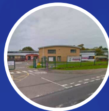
Boundary Primary School Dinmore Avenue, FY3 7RW