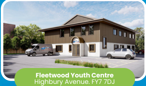
Fleetwood Youth Centre Highbury Avenue, FY7 7DJ

We also work closely with 6 partner schools: