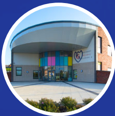
Blackpool Gateway Academy Seymour Road, FY1 6JH