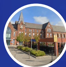
St Mary's Catholic Academy St Walburgas Rd, FY3 7EQ