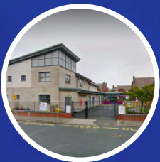
Thames Primary Academy Severn Road, FY4 1EE

We also work closely with 6 partner schools: