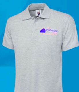
Senior Leaders Grey Polo Shirt / Hoodie