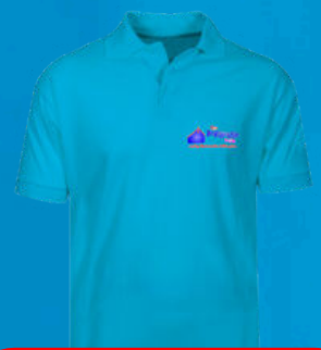
Young Leaders Light Blue Polo Shirt / Hoodie

All of our sessions will have a Senior Leader onsite or nearby. Feel free to ask for them if you have any questions or concerns.