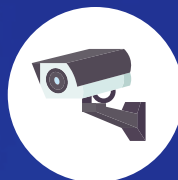
All Sites covered by CCTV