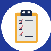
Fully Risk Assessed