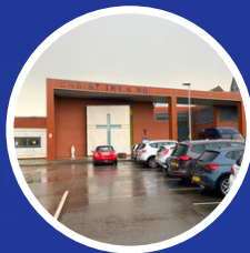
Christ the King Catholic Academy Rodwell Walk, FY3 7FG